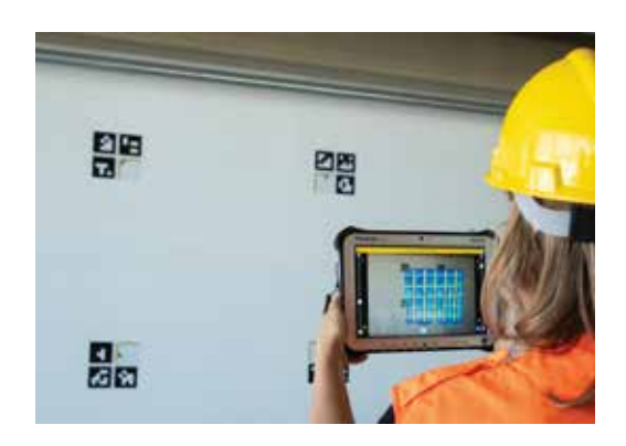
Augmented Reality for real time data visualisation with more accuracy